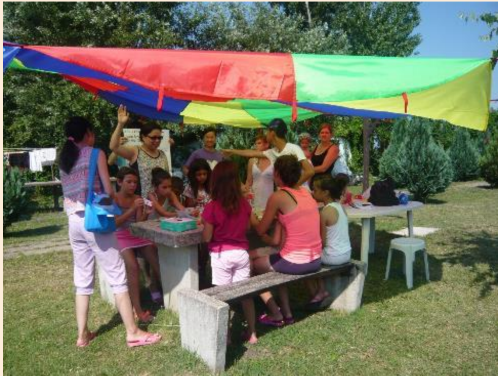
Another picture from the 2015 mission

Are you willing to lead the Roma children to play games, learn handicrafts or help them prepare for schools?