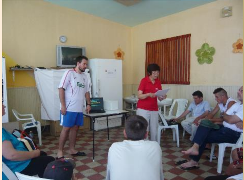
A picture taken in July, 2015 during a short term mission for the Roma in Hungary

The Roma have long suffered from incorrect values of family and marriage. Are you willing to share to them the lessons you learned from the Bible?